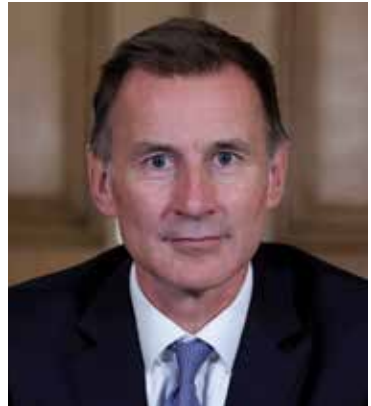
Official portrait of Jeremy Hunt MP